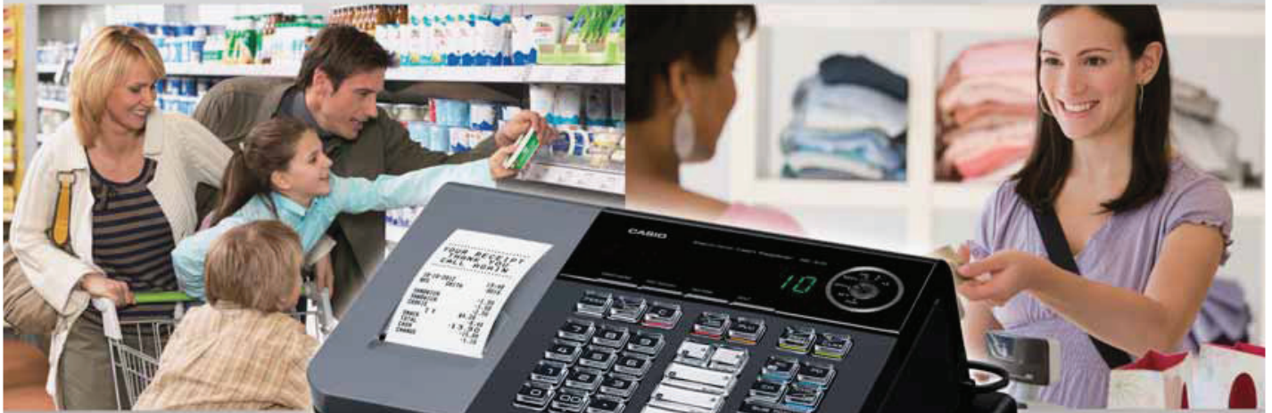
Small drawer model

The SE-S10 smart cash register combines convenience in setup and day-to-day operation with deluxe features such as a customer-friendly rear display and antimicrobial keyboard. This stylish, compact register suits any retail environment.